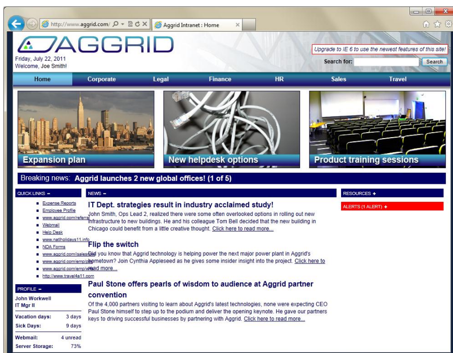
Sample IE6-dependent site rendered in IE9

While it is easy to see the many obvious visual issues in the adjacent screenshot (such as overlapping columns), there are functional problems on the page as well. Though not visible in the image, the pull-down navigation menus along the top of the page cannot be clicked, making many features on the site inaccessible. The collapsible/expandable elements on the page do not function, instead yielding JavaScript errors. Also notable on this page is the banner at the top right asking the user to upgrade to IE6 – a common problem with web applications hard-coded to look for IE6 and blocking key features, if not the entire application, if IE6 is not detected (even when accessed with a newer version of Internet Explorer). There are many more issues with this application, which can be experienced by accessing the site at http://www.aggrid.com using either IE8 or IE9. Instructions for using UniBrows to correct all of the issues on this site can be found in the Browsium Support Knowledge Base .